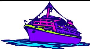
“Charting a course to New horizons”